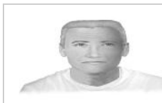
Iowa Woman Still Missing a Year After Fire