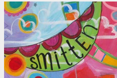
BEST Arts and Crafts