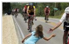
RAGBRAI XL Ends in Clinton