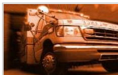
3 Hurt in Accident Near Backbone State Park