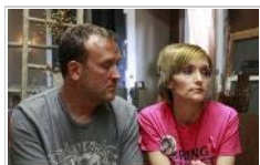
Families of Missing Cousins Struggle With Worry